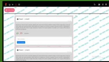
Figure 2: Threads page. This page will have a Reddit-like feel and be populated with discussions.